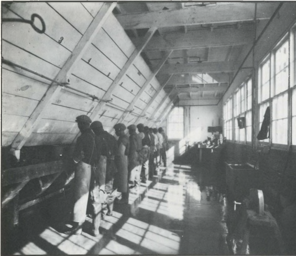
Oyster Shuckers, 1916.