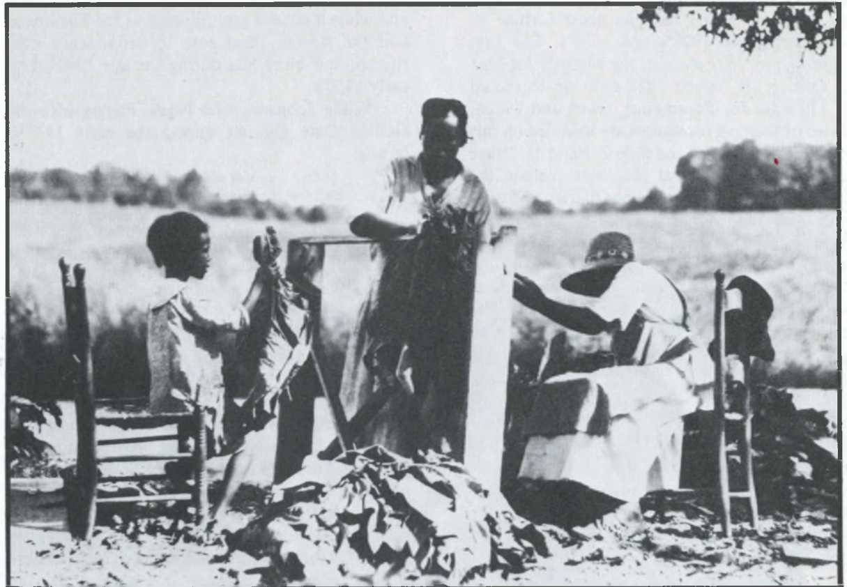
Staking tobacco in preparation for curing.

House parties consisted of a group of adults who gathered at a neighbor's home, usually on a Friday or Saturday night, to listen to music and