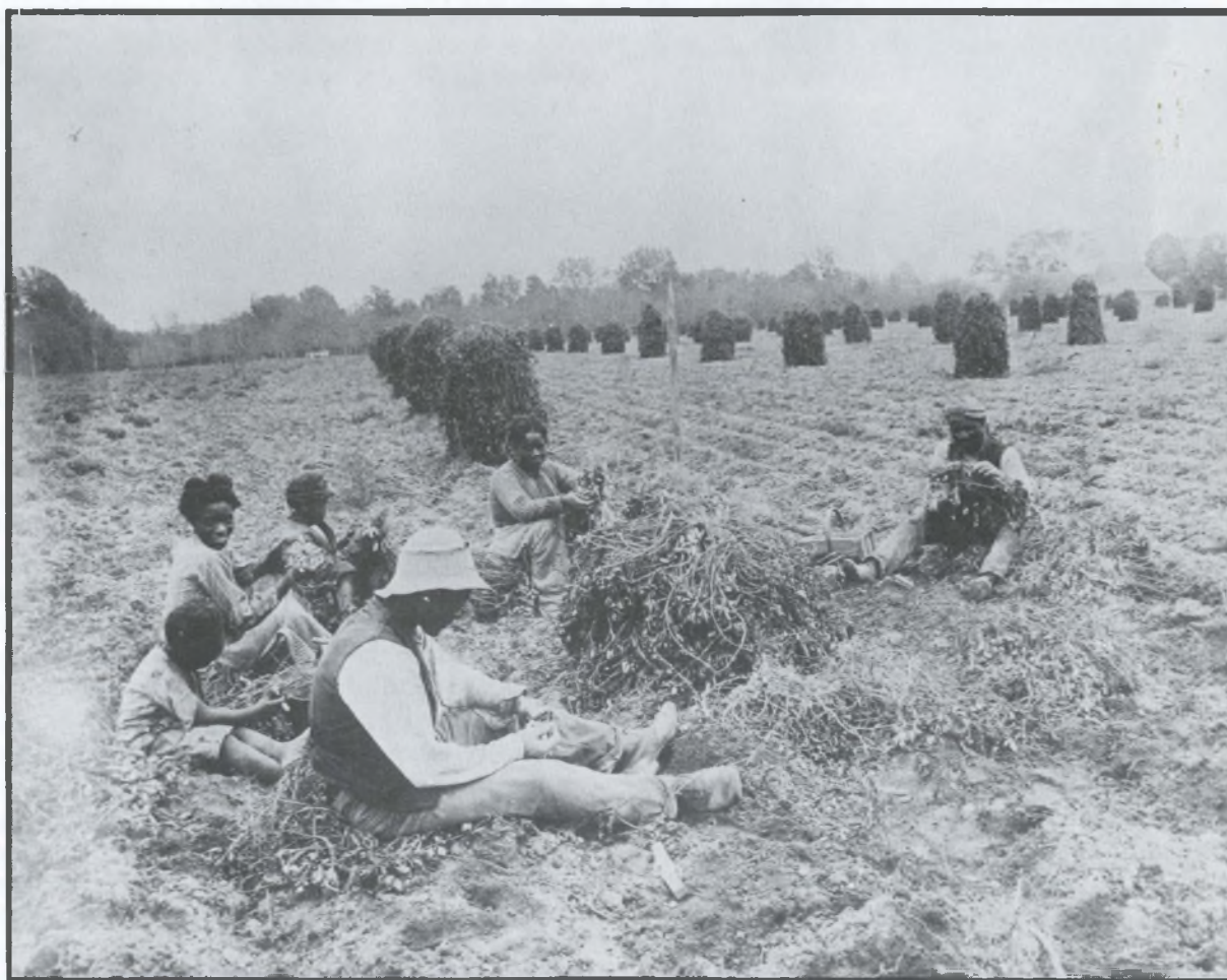
Picking peanuts from stacks of dried vines.

The land near the coast is dominated by water-related industries such as boat and ship building, fishing, oystering and beach resorts. The armed services have for many years been firmly entrenched in Tidewater and today the Navy alone supplies the area with thousands of jobs. Further inland there are many small family-operated farms, but in the counties to the south of the